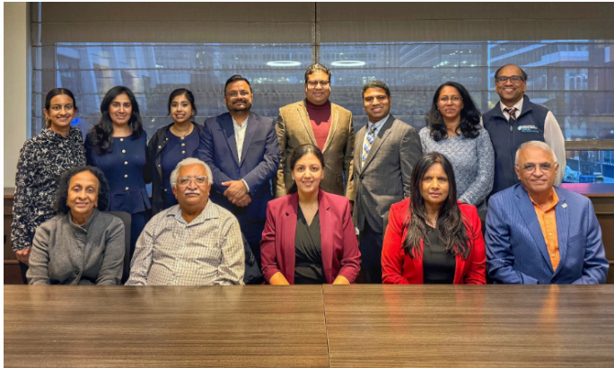
IAPA FALL MEETING 2025, CHICAGO BOT, EC AND EEC