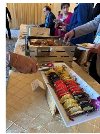
Pictured L-R: IAPA Banquet attendees and food Catered by Jalsa Catering.