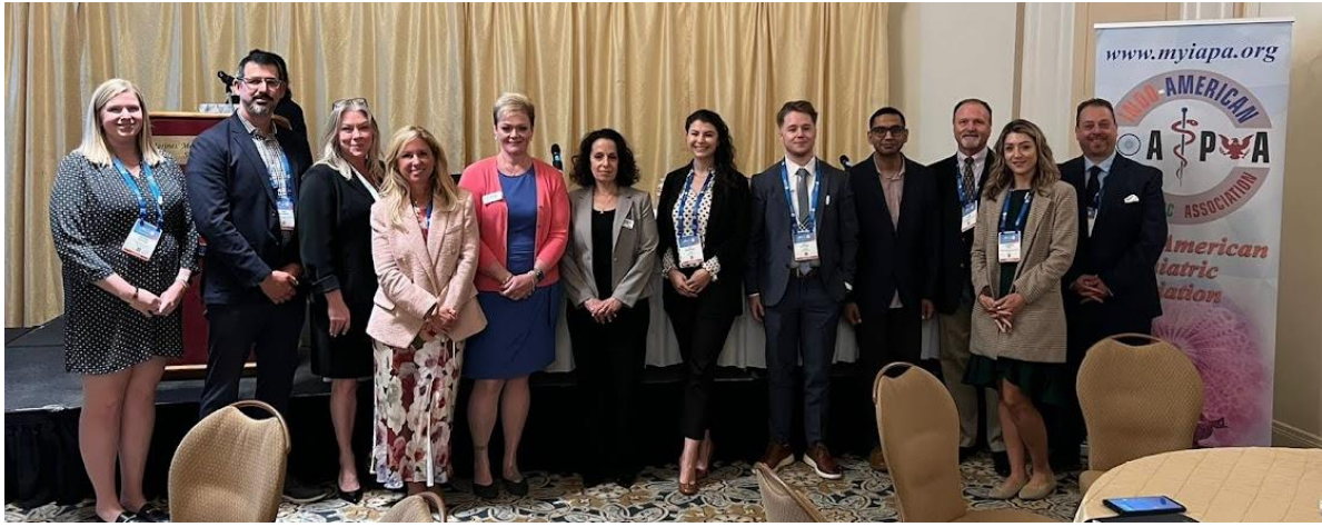
Pictured: Representatives from sponsors for the IAPA Annual meeting. Thank you to our 2023 IAPA Meeting sponsors: Shepard-Pratt, Genesight, Idorsia, IDgenetix, Abbvie, Corium, and PRMS.