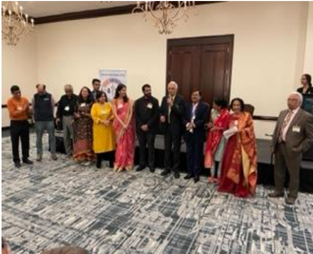
IAPA officers at the banquet.