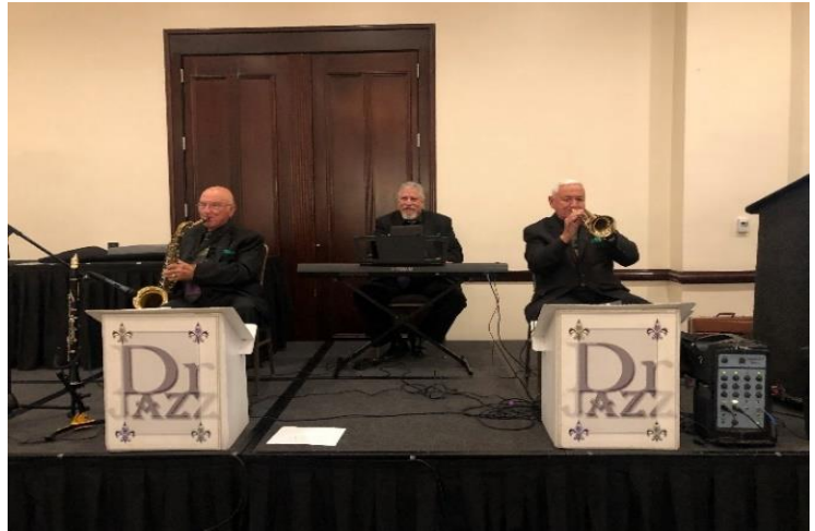
Live jazz entertainment provided by Dr. Jazz during the second part of the evening.