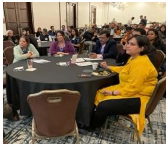
IAPA Banquet attendees listening to presentations while enjoying appetizers during the first part of the evening.