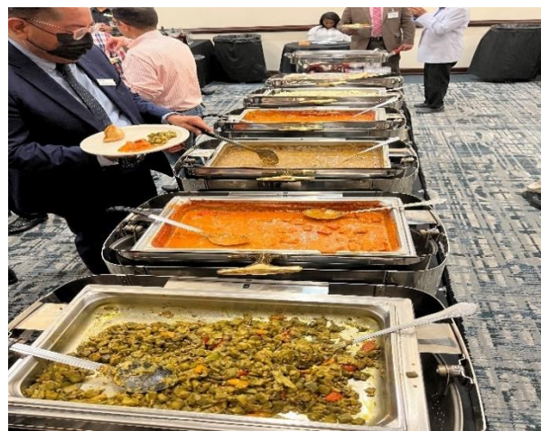
Delicious Indian cuisine catered by Nirvana Indian Restaurant.