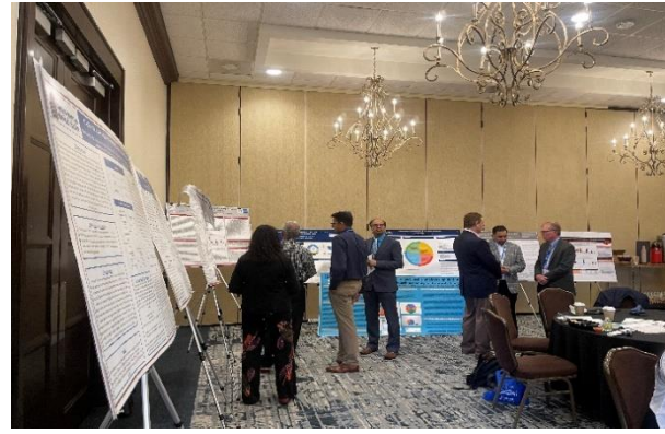
Morning Scientific Session (left) and Poster Competition (right) pictures.